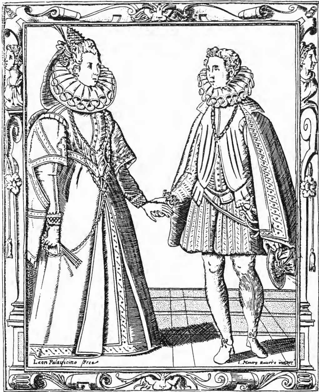
Fig. 1 - NEGRI, Le gratie d'amore , p. 177.