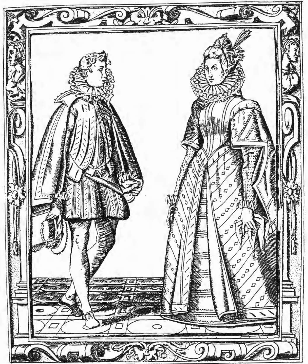
Fig. 2 - NEGRI, Le gratie d'amore , p. 181.